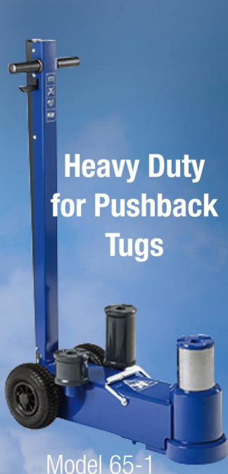
Heavy Duty for Pushback Tugs

Running an airline on time requires superior Ground Support Equipment (GSE) and Stertil-Koni is here to help. As the leader in heavy duty vehicle lifts, we have a dedicated portfolio of robust, highly engineered air-over-hydraulic jacks for all GSE lifting situations — from small portable lifting requirements to efficiently raising powerful pushback tugs.