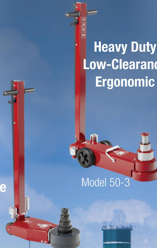
Heavy Duty Low-Clearance Ergonomic