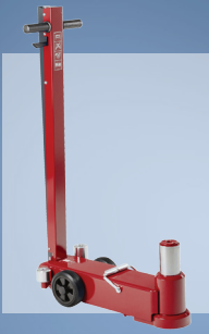
Model SK25-1 Single-stage jack for vehicles and machinery