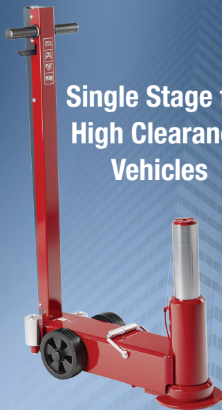
Single Stage for High Clearance Vehicles