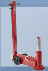
Model SK25-1H Single-stage jack for agricultural contractors' machinery, trailers, and other high clearance applications