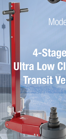
4-Stage for Ultra Low Clearance Transit Vehicles