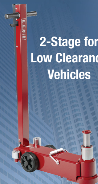
2-Stage for Low Clearance Vehicles