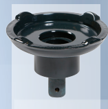
SKFW Floor-Jack Saddle Round, black adapter with no rubber pad. Designed for lifting under bolts, differential gear, etc. 22,000 lbs. capacity