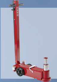
Model SK25-2 Two-stage versatile hydraulic jack for buses and trucks