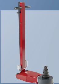
Model SK40-4 4-stage jack for ultra low transit vehicles

EXTREMELY LOW & STABLE The lowest jack on the market with a minimum height of only 4 in.