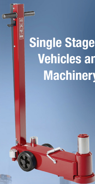
Single Stage for Vehicles and Machinery

Whether you're operating a small trucking fleet or a major transit system, uptime is key. And Stertil-Koni is here to help. As the leader in heavy duty vehicle lifts, we have a dedicated portfolio of robust, highly engineered air over hydraulic jacks for all types of transit and trucking situations — from small, portable lifting requirements to efficiently supporting heavy duty vehicles of all sorts.