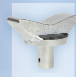
SKFW1 Floor-Jack V-Shaped Adapter Designed for lifting under various types of axles. 22,000 lbs. capacity