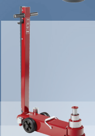
Model SK50-3 High capacity ergonomic 3-stage jack for low clearance vehicles