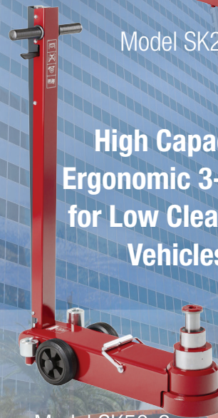
High Capacity Ergonomic 3-Stage for Low Clearance Vehicles